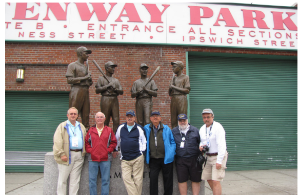
2011 at Fenway Park in Boston, MA