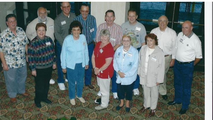
Reunion in Branson, MO – 2006