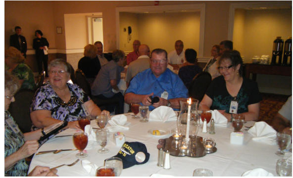
2012 Farewell Dinner in Washington, DC