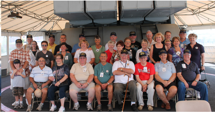
The USS Decatur reunion in Washington, DC – 6-9 September 2012