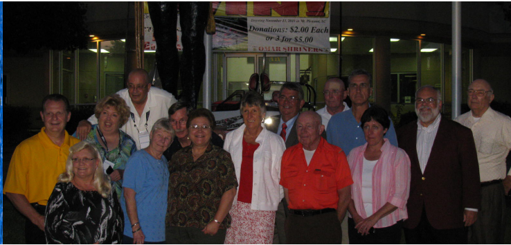
Reunion in Charleston, SC – 2010