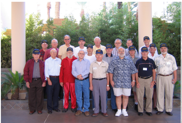
Reunion in Las Vegas, NV – Sahara – 2007