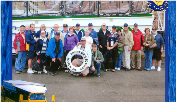
Reunion in Boston, MA-Duck Tour-2011