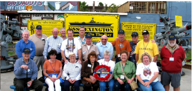
Reunion in Corpus Christie, TX – 2008