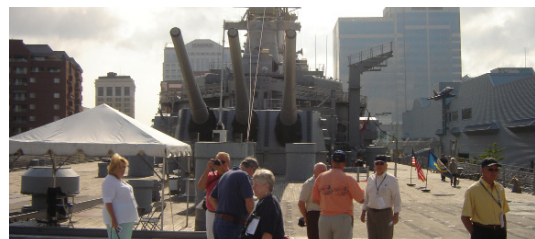
2009 in Norfolk, VA