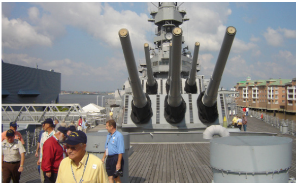
Reunion in Norfolk, VA – 2009