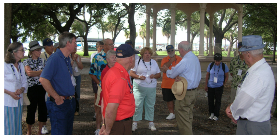
2010 Touring in Charleston, SC