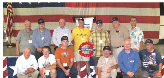
2008-Lexington-Corpus Christie, TX